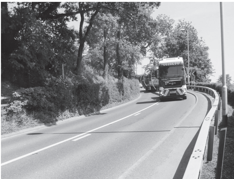
Photo left is June 2010 mock convoy negotiating Nelly Wynn's corner. All other road traffic was stopped whilst this one transporter came through

The busy road that bisects Pant and Llanymynech, is the source of concern to everyone living in the vicinity. The high volume of traffic traveling the A483 through the village with very narrow pavements to access schools, shops, pub or village Hall is a subject continually raised by the Parish Council. Every year has contained meetings on possible solutions to the problem and 2010/11 is no exception. The year began with news of a very costly repair at the north end of Pant where the embankment was collapsing, (unfortunately a Bypass was not seen as a solution). Traffic chaos ensued while the embankment was re-built with 3 way lights in place, and it was avoided by the HGV traffic which followed a diversion. Early in the year, meetings were held to learn of the implication of convoys transporting wind turbines through the village to the proposed wind farms in Wales. In June a trial run of a mock convoy took place and was observed and timed through Pant. Briefing meetings and forums have been attended and the Council is joining a Working Group set up to administer a fund for community benefit for villages affected by the wind farms.