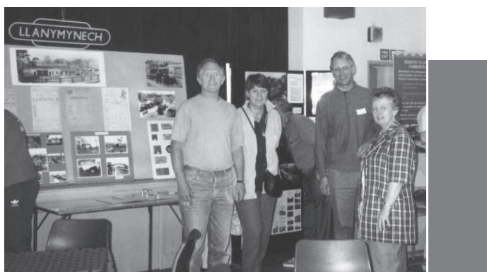
Memories event Llanymynech May 2000

One of the most notable achievements of the Heritage Partnership is the cross border co-operation between local authorities. There now exists a Working Group of Officers on both sides of the border. Powys has matched the Conservation Area with a similar designation on the Welsh side of the village and their Officers support a variety of initiatives.