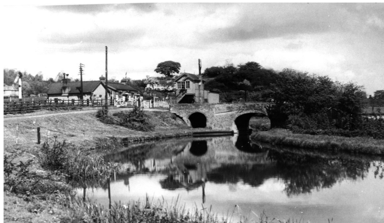
WHERE AND WHEN????

The Council's Millennium Memories Books, which have been circulating the village for residents to write down their anecdotes and tales of the past, will also be on display and will be available to add additional information.